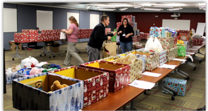
Staff packing boxes full of gifts for families in our Holiday Connections drive.

collected dozens of boxes full of gifts, essentials and gift cards for families in need. Meanwhile, students volunteered to sort and pack food to provide meals to those without this holiday season. Thank you to all who donated.