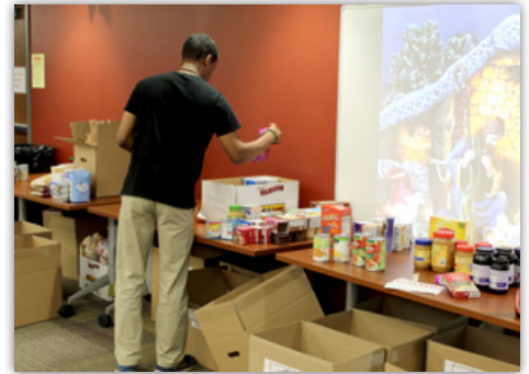
Students sorting canned goods and other non-perishable items for the Guardian Angel Basket drive.

The kindness and generosity of BOCES 2 staff and students was on full display again this year during the Holiday Connections and Guardian Angel Basket drives. In its sixth year, Holiday Connections