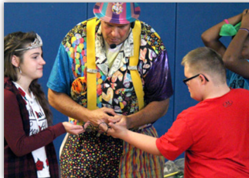
Students became part of the show, working together to help perform a series of astounding magic tricks.

Students eagerly vied for the chance to assist the Magic Man with tricks featuring floating ropes, disappearing coins and magic wands. They joined in applause for his call for them to get along, take care of each other and be "buddies, not bullies."